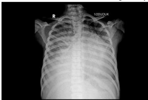
Figure 2. Chest X-ray.