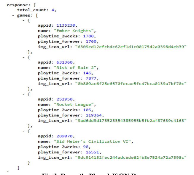
Fig 3. Recently Played JSON Response

We hit the API for one month daily to track changes in playtime_forever, determining daily play hours. Additionally, we used api.steampowered.com/ISteamUserStats/GetUserStatsForGame/v0002/?appid=1599340&key={{developer_